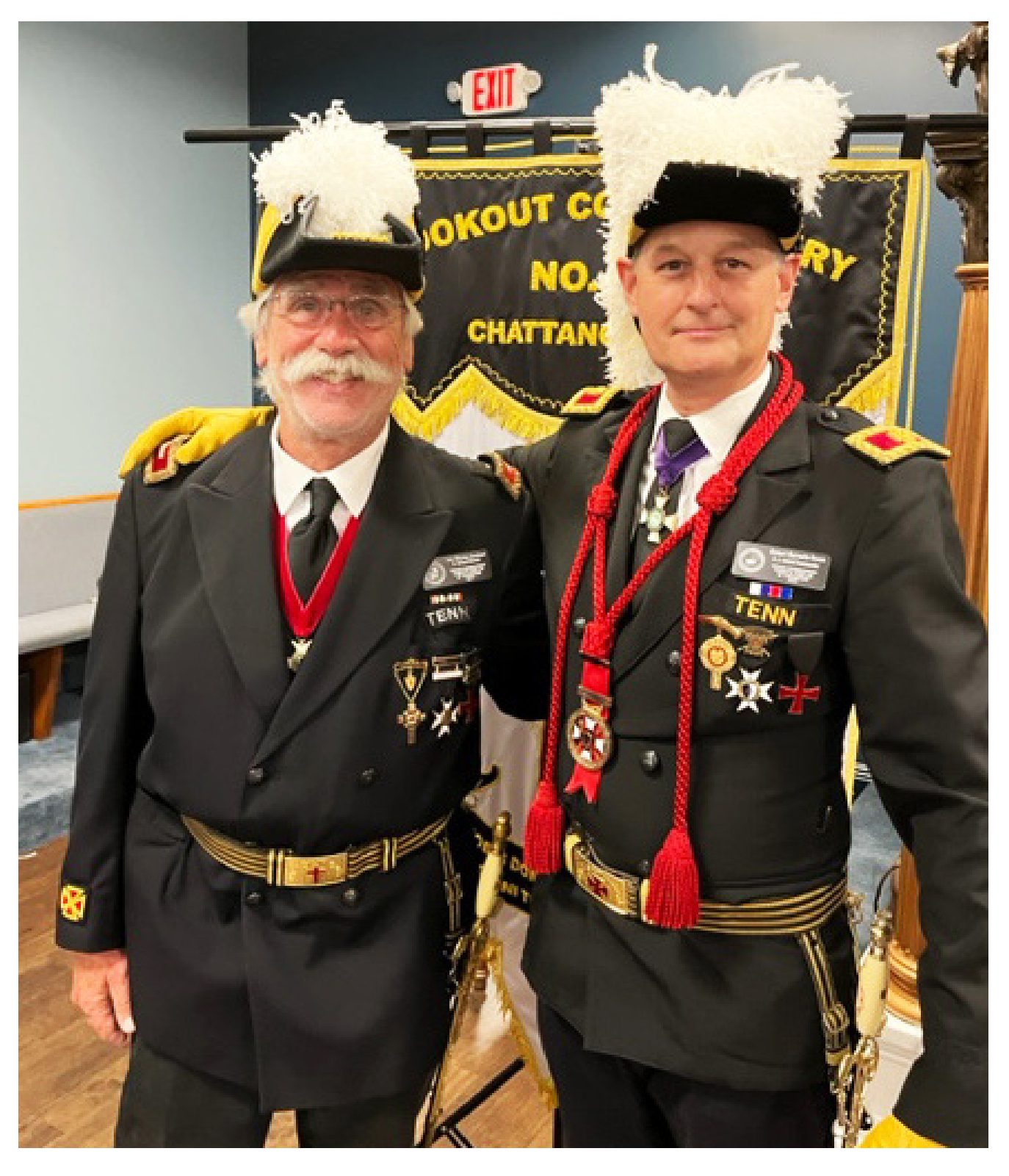
The Most Worshipful Grand Master and the Right Eminent Grand Commander