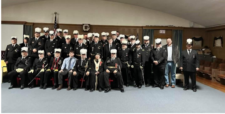
KINGSPORT #33 ST OMER #19 WATAUGA #25