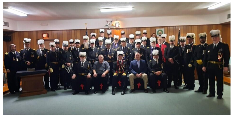
CHEVALIER #21 CAMPBELL CO #44