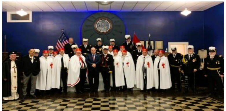
PARK AVE #31 ROSEMARK #39