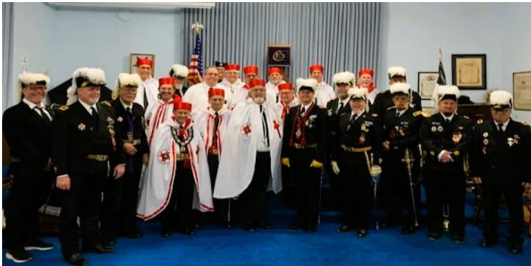
DE PAYENS #11