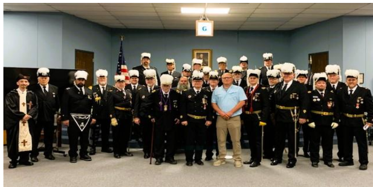
JACKSON #13 UNION CITY #29 LEXINGTON #36