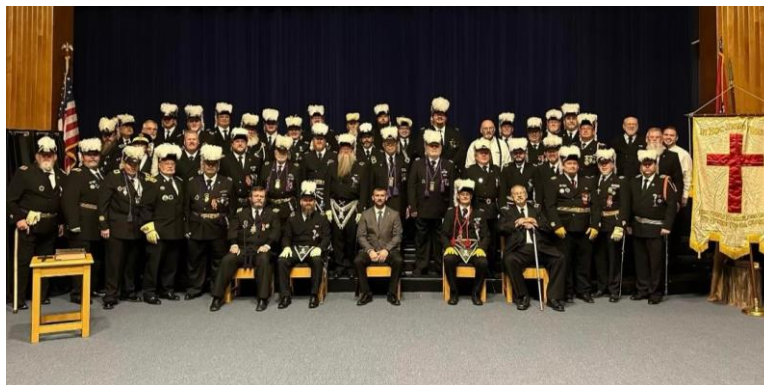
COEUR DE LION #9